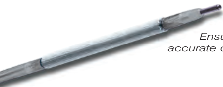
PowerCrimp™ Technology Ensures controlled delivery and accurate deployment

When precision deployment means everything, let Atrium's low profile platform make difficult entry targets possible. The ultra-thin premounted stent was designed with an extraordinarily small crossing profile. The patented covered stent design is a one-step precision delivery system, and is suitable for expansion diameters ranging from 5mm to 22mm.* The ultra low crossing profile is made possible by Atrium's exclusive PowerCrimp Technology and Atrium's latest Anertia™ balloon catheter technology. The Atrium balloon expandable V12 covered stent...the new benchmark for ease of use and precision deployment.