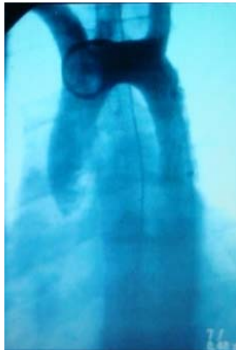
Final Result after 12mm x 29mm LD V12 Deployed