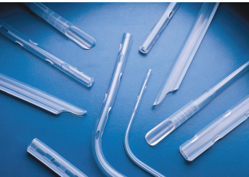
Atrium HydraGlide™ Silicone Chest Tube and Mediastinal Catheters